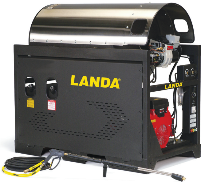
Landa SLX: 10 GPM, 2500 PSI, Dual-Gun Ready

During the Exxon Valdez cleanup, only one pressure washer manufacturer proved equal to the task.