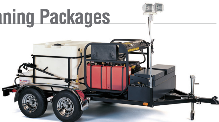
TR-6000 double-axle trailer shown with optional pressure washer, fuel and tool box, work lamp, chrome fenders and wheels

Landa has two trailer-mounted wash systems for on-site cleaning, a single-axle trailer with 200 gal. water tank and a double-axle model with a 330 gal. tank. These top-quality packages allow you to customize the trailer to your needs by mixing and matching trailer beds, pressure washers and a wide selection of options and accessories.