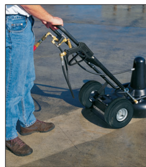
The Water Jet attaches to a hot or cold water pressure washer and cleans flat surfaces fast using a water-propelled spray bar that spins at 2000 RPM

The stainless steel spray bar, with two precision spray nozzles, spins at an astounding 2000 RPM. Its pneumatic tires and leading swivel caster make for easy maneuvering into corners and tight spaces.