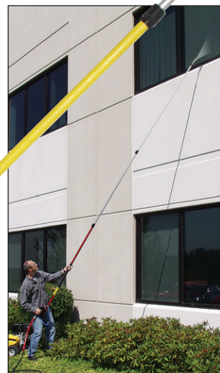
Landa's telescoping lances offer a safe alternative to power washing with a ladder or scaffolding